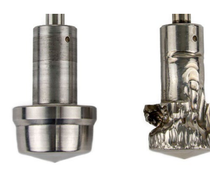
Control Valve Plug

The primary concern of moisture flowing through the main valve and seat of a control valve or regulator is the effects of flash steam. It is important to know that not all the water droplets will flash. When moisture flashes into steam it undergoes a rapid expansion. With this expansion comes an associated increase in velocity. This increase in velocity, partnered with the fact that not all the moisture will flash, means that there is liquid water flowing rapidly over the trim surface. This can cause erosion on the valve plug.